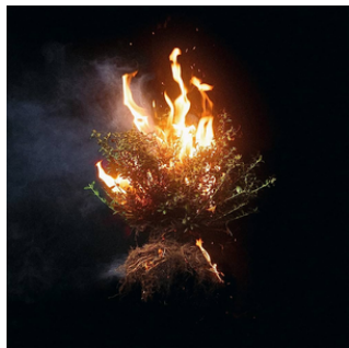
Can You Imagine? (Elevation Worship)