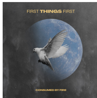
First Things First (Consumed by Fire)